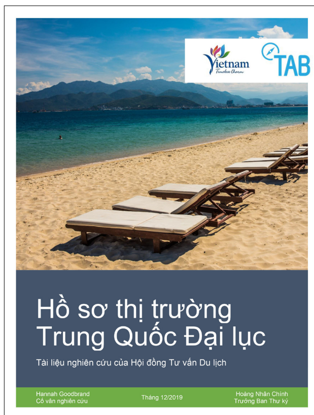
Market Profiles in Vietnamese