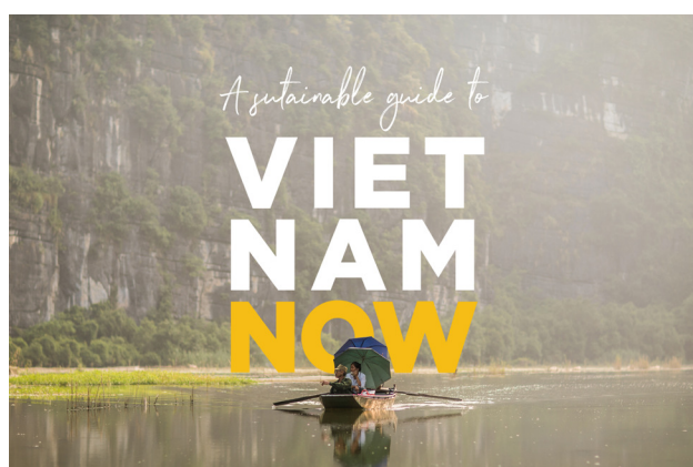
Green Travel Guide