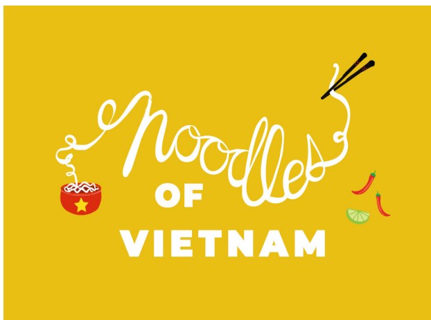
Food of Vietnam