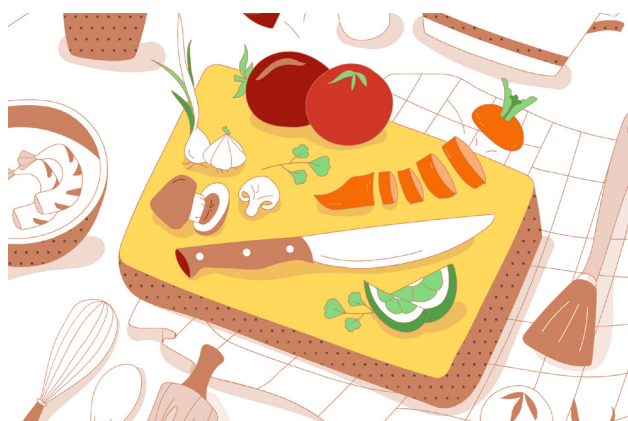
Vietnamese Home Cooking