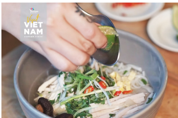
Vietnamese Home Recipes