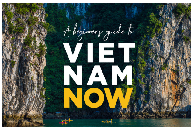
Beginner's Guide to VietnamNOW

The booklets at the links below may be uploaded and published to the Internet, or downloaded and printed following the guidelines in the ‘Terms of Use.’ These booklets include a guide for first-time travellers to Vietnam with a clear first level of introduction to the country and basic insight on travelling in Vietnam; five classic home-cooked dishes for travellers to recreate, with step-by-step videos and an accompanying recipe booklet; a sustainable travel guide created together with the Swiss Sustainable Tourism Programme (SSTP) featuring tangible trip ideas for responsible travellers; and a set of hand-drawn colouring sheets inspired by Vietnam.