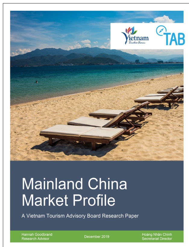
Market Profiles in English

TAB together with World University Services of Canada (WUSC) has conducted research on travellers in Vietnam's target markets. TAB makes this research available to the travel industry for the purposes of better understanding each market and how to attract high-quality travellers to Vietnam. Please provide a backlink to vietnam.travel when republishing or quoting these surveys online.