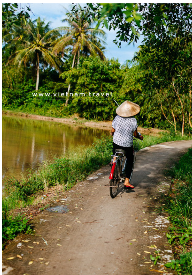
Vietnam gallery by Aaron Joel Santos

TAB has prepared two public image libraries for the promotion of Vietnam. Images at the links below may be used for marketing Vietnam and its destinations following the guidelines in the 'Terms of Use.' Photographer credit is required for each picture.