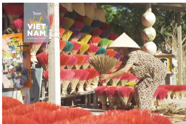
Crafts of Vietnam